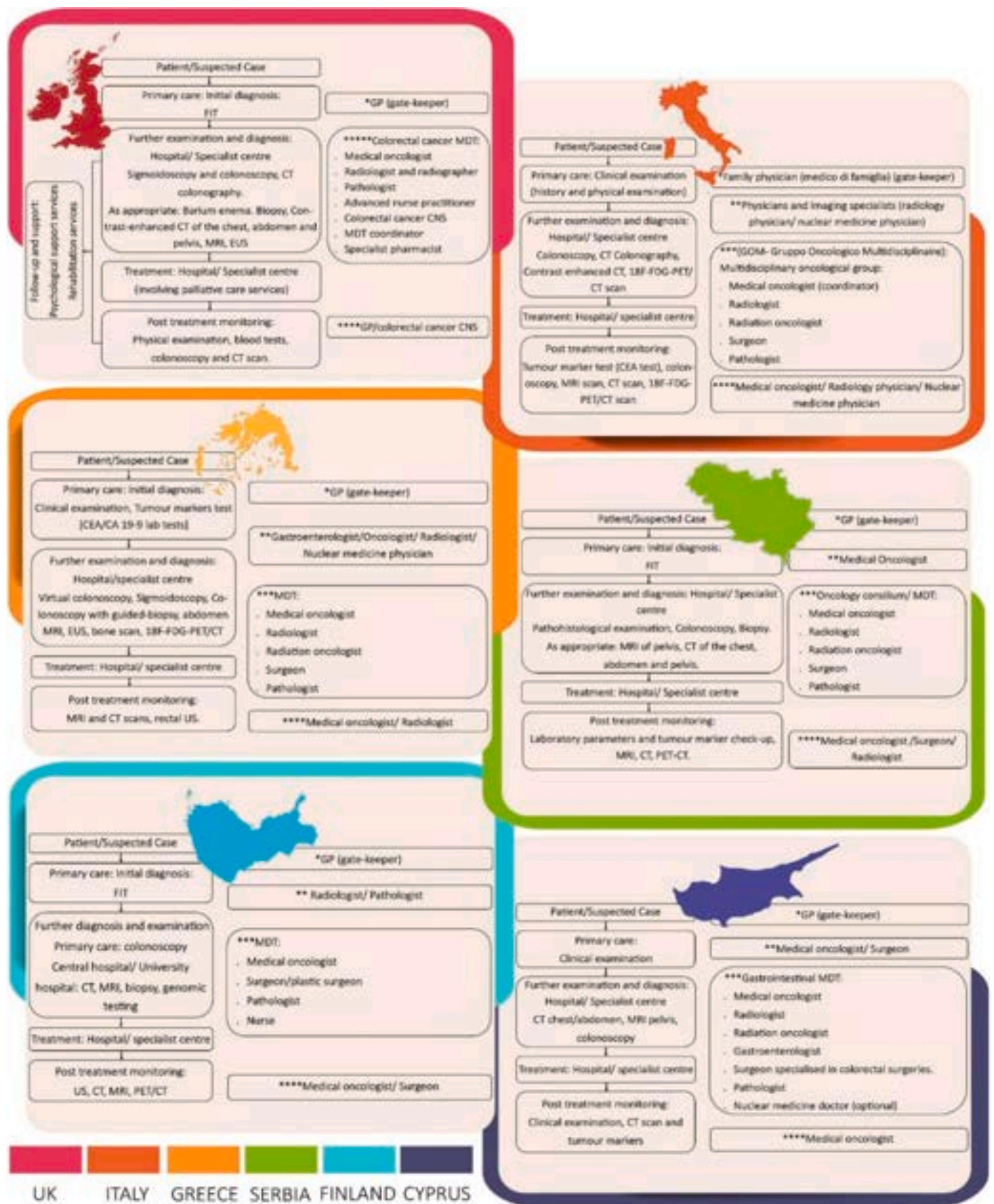
Fig. 4. Colorectal cancer care pathways in six European countries. * First healthcare professional(s) involved in the care pathway. ** Healthcare professionals involved in further examination and diagnosis including disease staging. *** Healthcare professionals involved in treatment. **** Healthcare professionals involved in post-treatment monitoring. ***** Healthcare professionals involved in further examination and diagnosis (including disease staging) and treatment at the same time.