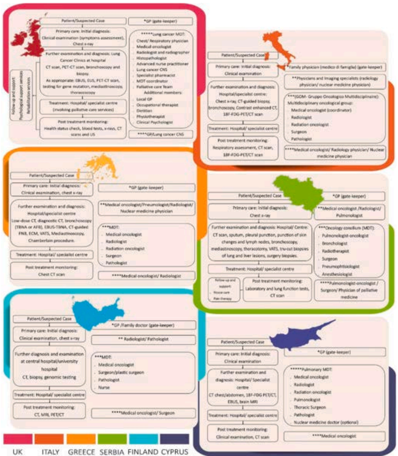
Fig. 3. Lung cancer care pathways in six European countries. * First healthcare professional(s) involved in the care pathway. ** Healthcare professionals involved in further examination and diagnosis including disease staging. *** Healthcare professionals involved in treatment. **** Healthcare professionals involved in post-treatment monitoring. ***** Healthcare professionals involved in further examination and diagnosis (including disease staging) and treatment at the same time.